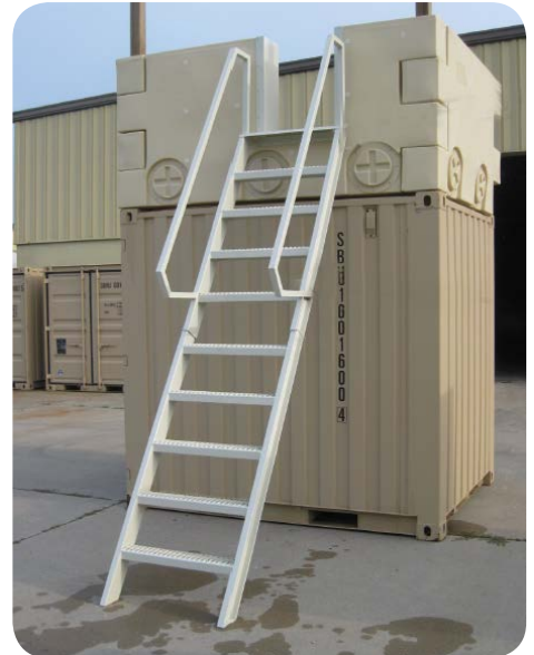
OPTION 1 bolt on Stairs/ Walkthru