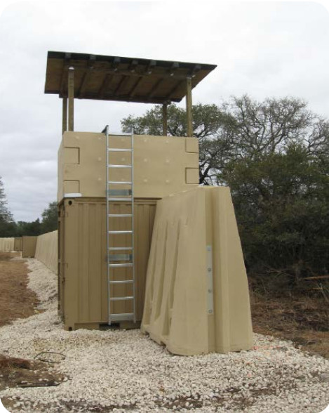
OPTION 1 straight Ladder only

Easy removal of the ballast allows the Guard Tower to be repositioned as needed.