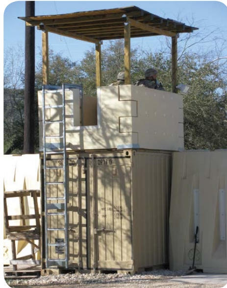
OPTION 1 straight Ladder/ Walkthru