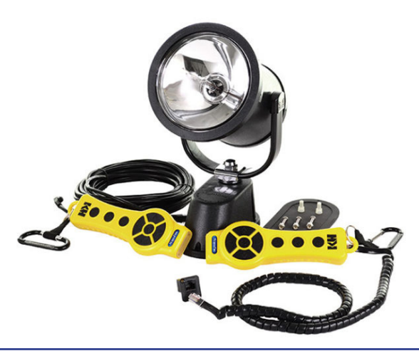
HID XENON 750,000 Candle Power