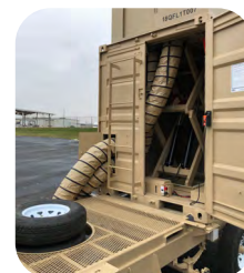
OPTION HVAC ventilation ports and 2 each 25 ft long hoses