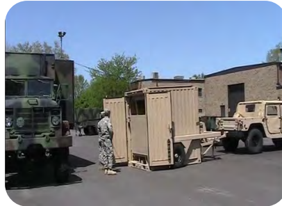
Deployment Position guard tower activate lift

GTP-1 comes equipped with battery powered hydraulic scissor lift system that is charged by a solar panel. By pushing the button, the guard tower is raised into the deployed position.