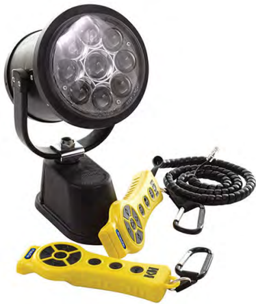
LED 215,000 Candle Power

Long Range remote illumination for HID & LED Spotlights with wireless controller Activate lights up to 200 feet away - (60 meters).