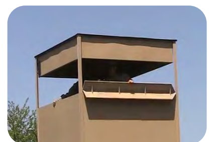
Visors Equipped with fold out rain & shade visors, folding weapon support shelves and a radio storage shelf, all attached to the ballistic walls.