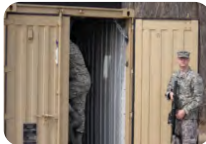
Stairs The solid steel internal stairs provides access to the Guard Tower. A trap door is closed over the entry area while in use.