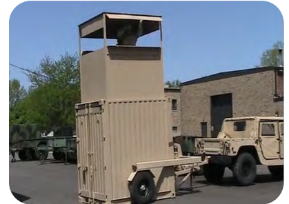
Fully Extended Guard tower is locked and ready