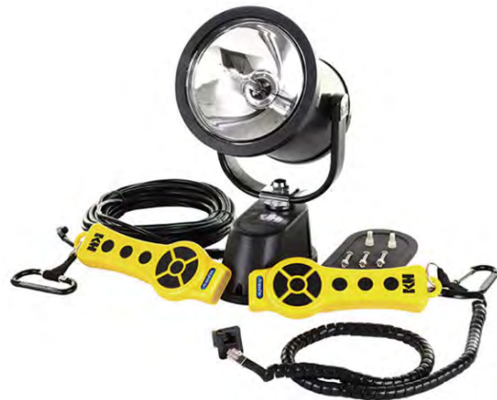
HID XENON 750,000 Candle Power