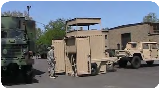
Secure Once raised, the scissor lift is locked into position with a turnbuckle in each corner.